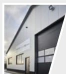
2021 Meuspath, Germany Nürburgring Workshop