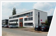
1997 Hanover, Germany Europe Technical Center (ETC)