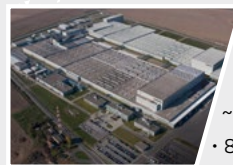
2007 Rácalmás, Hungary European Plant