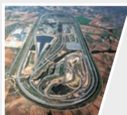
2006 Idiada, Spain IDIADatrac Workshop