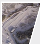
2017 Ivalo, Finland Hankook Technotrac